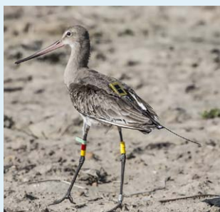
Released black-tailed godwit in Spain.

The tracking of several species and populations of godwits and knots by the Global Flyway Network consortium over the last eight years, rather than to describe their migratory movements (which are generally well-known), serves to pin-down any bottlenecks in annual cycles. We relate the use of sites with subsequent performance (i.e., timing of migration, breeding success, survival, and physical state based on visual observations). This approach is illustrated by our study on black-tailed godwits tracked during the last leg of their northward migration between the nonbreeding area in West Africa and the Dutch meadows where they breed in two contrasting springs: one of the coldest on