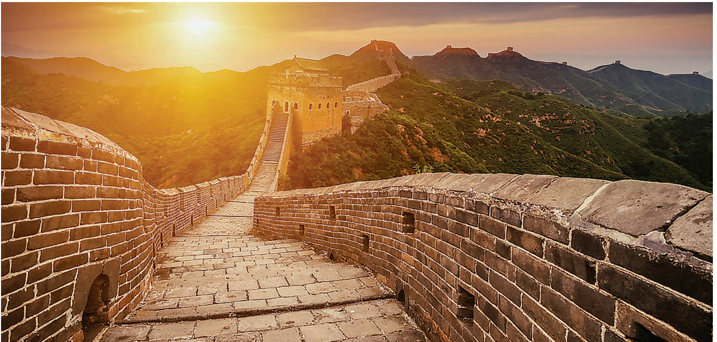
The ancient Great Wall.