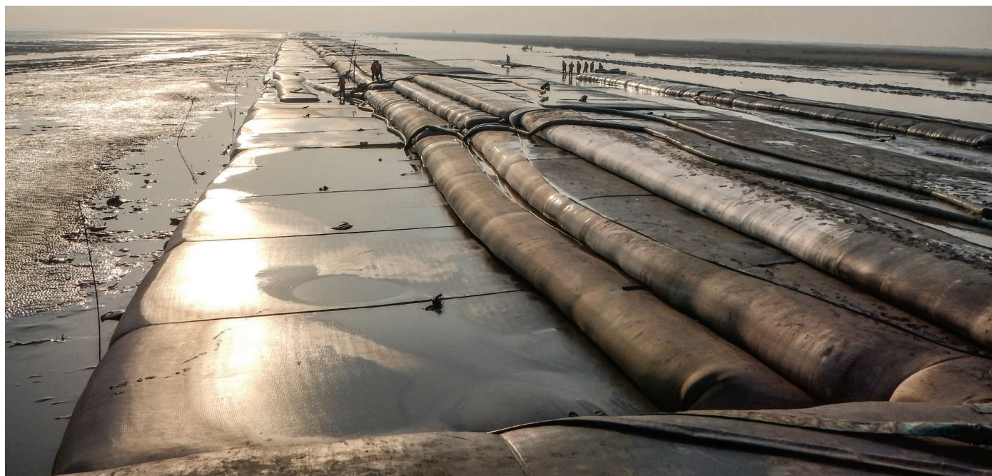
The “new Great Wall.” A seawall that is being built in the Yangtze estuary. Seawalls such as this are creating land and reducing ecosystem services along the coastal wetlands of China. (Right) The ancient Great Wall (yellow line) and the 11,000-km seawall on the coasts of mainland China (red line). The discontinuity of the walls is not visible because of the map resolution.

been increasingly used to enclose coastal wetlands for agricultural and industrial uses over the past several centuries (6, 7). This has caused a great loss of coastal wetlands and their myriad of ecological services.